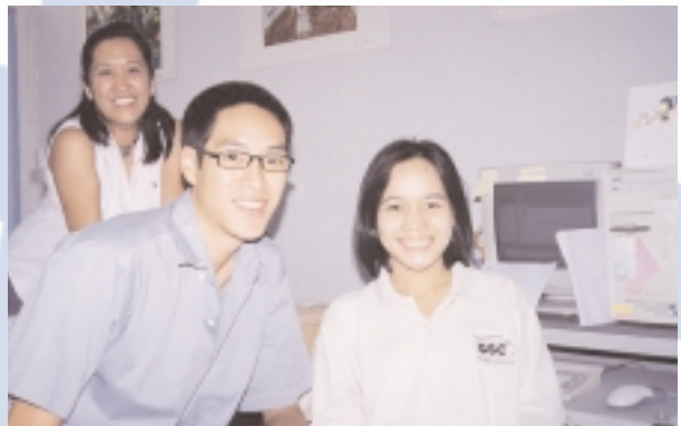
Staff of the Asian Regional Resource Center for Human Rights Education in Bangkok during a training conducted by HREA to establish a regional electronic network for the Asia-Pacific region.

Amnesty International-USA, Arabic Network for Human Rights Information, Cairo Institute for Human Rights Studies, Council of Europe, HURIDOCS, Instituto Interamericano de Derechos Humanos (IIDH), International Human Rights Law Institute at DePaul University, Moscow School of Human Rights, Northern Ireland Human Rights Commission, Research and Training Centre for Human Rights and Democratic Citizenship-Zagreb, Union Interfricaine des Droits de l'Homme (UIDH), University of Minnesota Human Rights Center, and Women's Learning Partnership for Rights, Development and Peace (WLP).