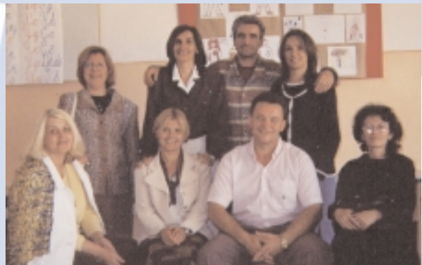
Teachers from the primary school “Ujedinjene nacije” in Belgrade, Serbia-Montenegro. HREA was part of a feasibility study mission for the Council of Europe that took place in Belgrade in September 2003.

These approaches combine to build the capacity of individuals and organizations to facilitate human rights learning. HREA offers thousands of materials free of charge, provides direct technical assistance, has ongoing trainings, networks educational and human rights professionals and works with practitioners and policymakers in developing new strategies to enhance the effectiveness of human rights education.